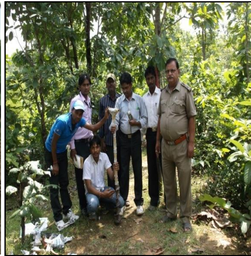
Soil Sampling Collection at Banka (Bihar)