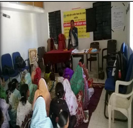
Women SHG Training at Gadchirolli (Maharashtra)