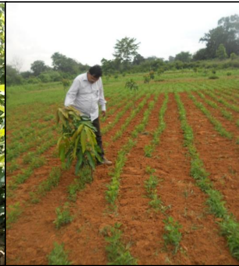
WADI Plantation Site Visit by M.D. in Simdega (Jharkhand)