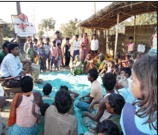
Interacting with villagers during socio-economic survey of villagers in Bettiah (Bihar)