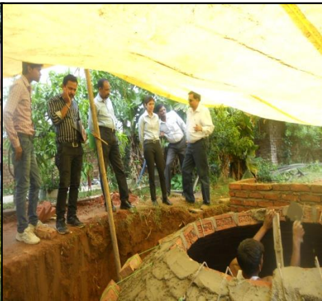
Biogas Construction Unit at Patratu (Jharkhand)