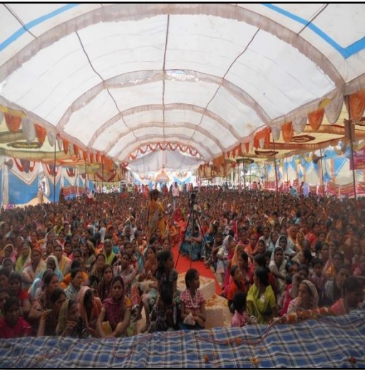
Mahila Mela under Tejaswini Programme in Balaghat (MP)