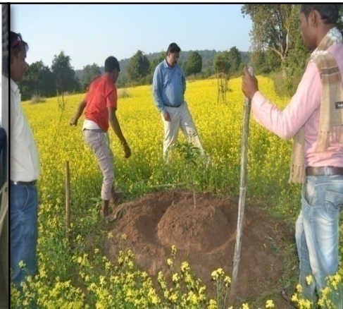
WADI plantation Site, Balaghat (M.P.)