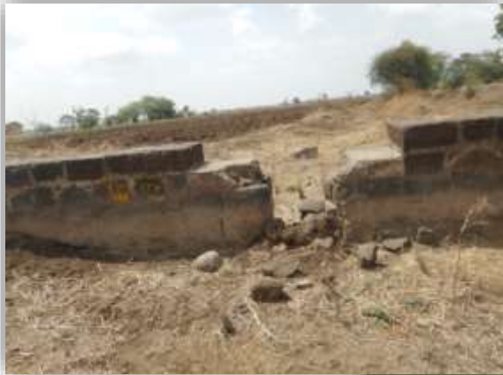
Silting in Dams and canals