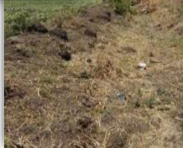
Farmers facing irrigation problem resulting in less interest in Farming