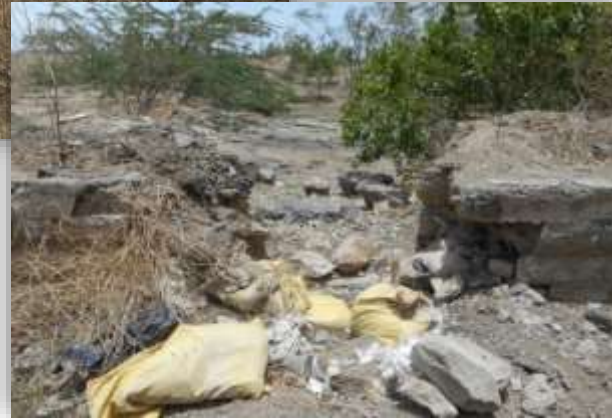
Defunct DBI systems since 25-30 years