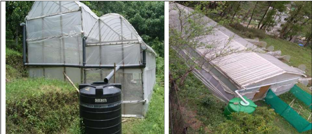
Roof Top Rain Water Harvesting