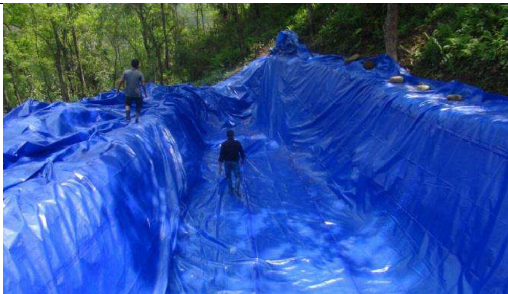
Plastic-lining of dug-out pond in progress